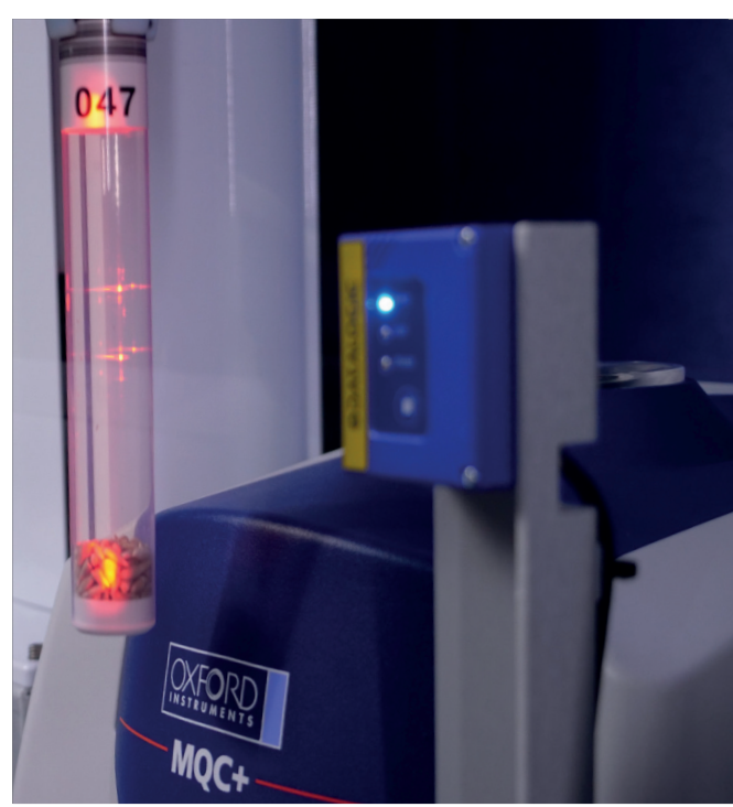
The optional barcode reader records sample ID and recalls previously stored tare weight of the tube.